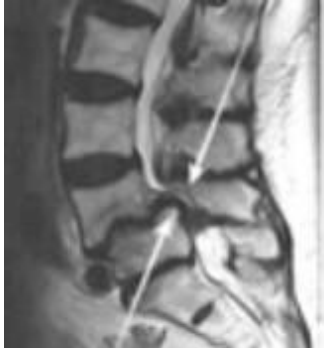
Sagittal MRI demonstrating lumbar spondylolisthesis at the L4/5 level

The presence of intractable radicular pain and neurological deficit is an indication for operative neurosurgical treatment. Neurosurgical treatment aims to relieve symptoms via decompressing nerves and with or without stabilising the spine (fusion).